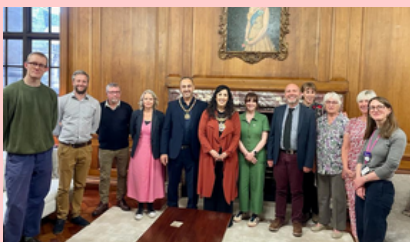
Coordinator meets the Mayor

I would like to thank; our board of trustees who take the responsibility for this charity seriously, attending our meetings and supporting our staff; to thank the staff and volunteers who make such a difference; and to the older people themselves who come together to make Assist the place it is.