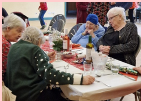
Christmas Day Lunch