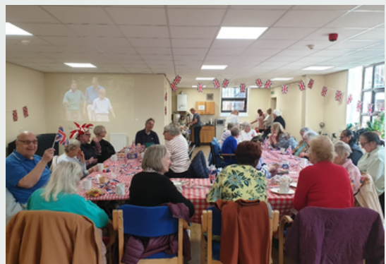
Coronation Party at Coffee group

Befriending Volunteer lifts Signposting and Advice Form filling and Advocacy Transport to social groups Wheelchair pushing Odd jobs Wheelchair/walker loan Emergency Shopping Lawn mowing/hedge trimming