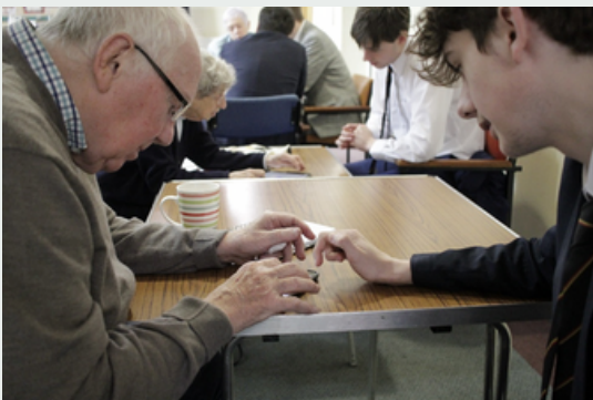
Mini trip to Manchester Museum

As a registered charity we are partly funded by Manchester City Council who cover salaries and some overheads. All other costs are raised by fundraising, grants and donations.